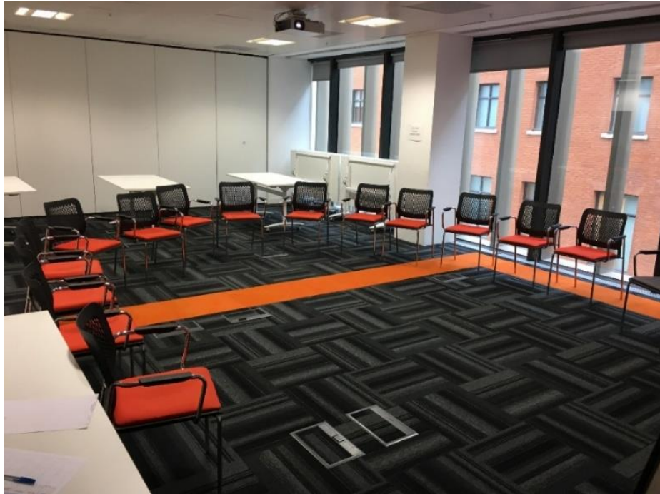
Figure 6: Classroom layout - breakout tables