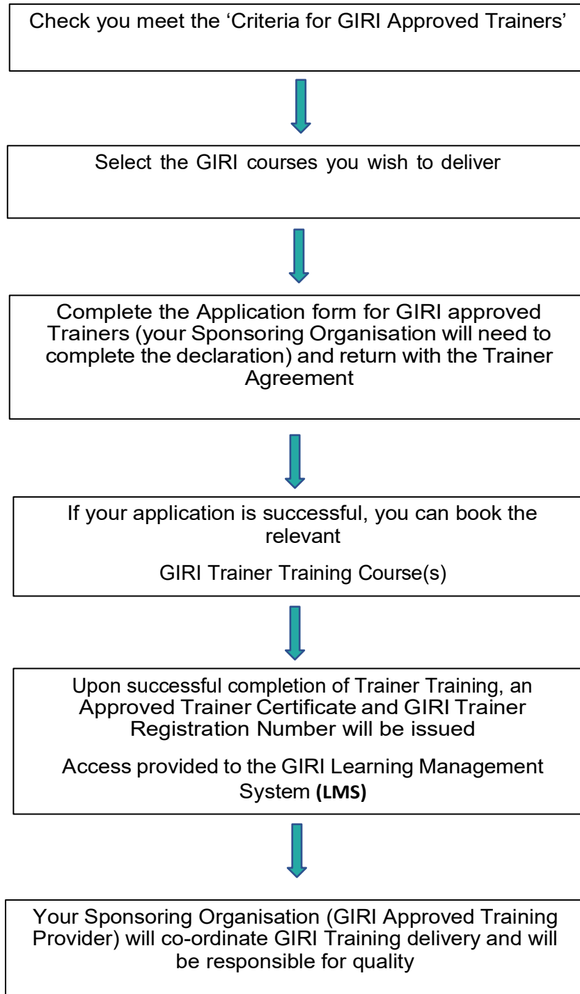
Figure 4: How to become a GIRI Approved Trainer